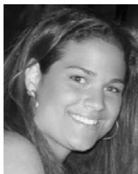
Luisa Iskin Traveling Picture Show Company