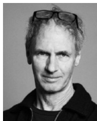
Frieder Schlaich Filmgalerie 451